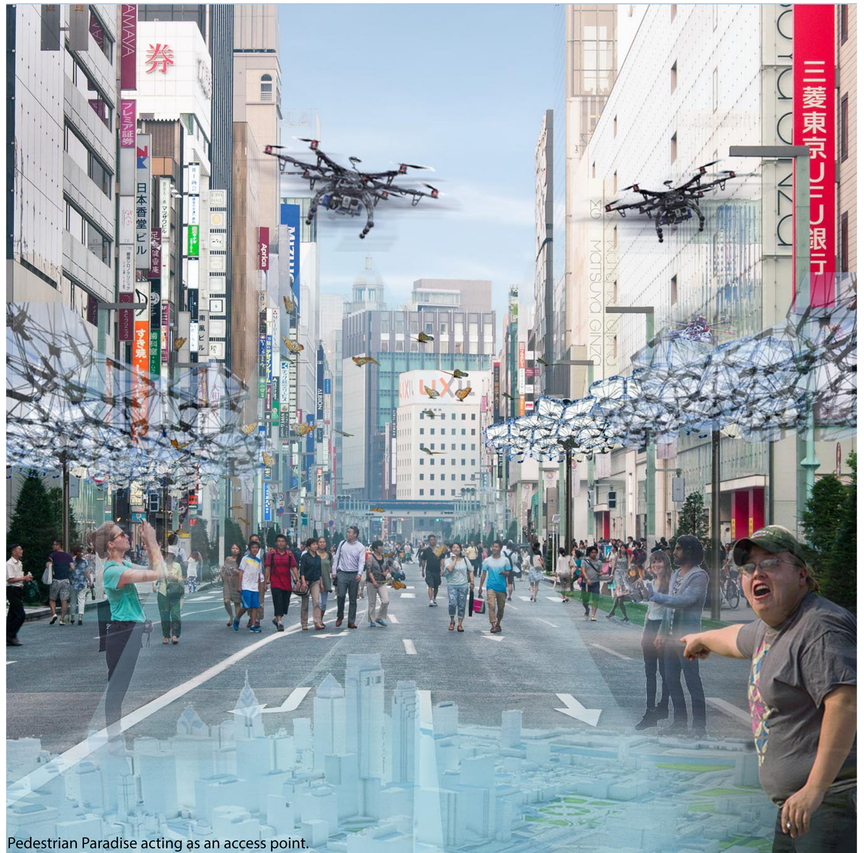
Pedestrian Paradise acting as an access point.

The whole system will be organized by collaborating between physical and virtual platform. An app can be developed for “Pedestrian Paradise” where people will decide what they want to do in next weeks Pedestrian Paradise. That app will also tell how to shop navigate in Ginza and where to find what?