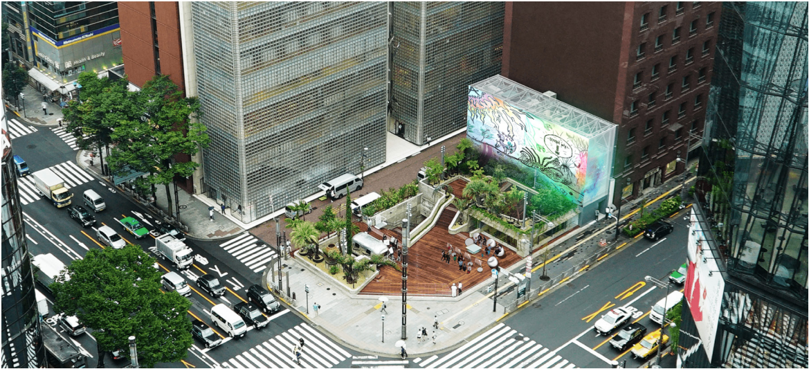
Ginza Sony Park

Innovative canvas helps to create collaborative works of art at any time. An interactive drawing performance made by public could be a fresh impression of mastering a new app.